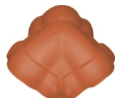
Hip cap No. 1099 for roof pitches of 18° - 50° Weight: approx. 3,6 kg