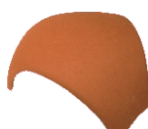
Hip cap No. 3099 for roof pitches of 16° - 50° Weight: approx. 5,0 kg