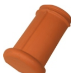
Roof ridge beginner/ender No. 302/303 Cover length: approx. 330 mm Cover width: approx. 200 mm Weight: approx. 3,5/3,4 kg