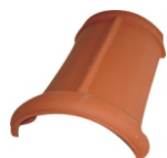
Ridge/hip tile No. 300 Cover length: approx. 320 mm Cover width: approx. 200 mm Needed: approx. 3,0 pro m Weight: approx. 2,9 kg