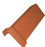
Universal shed roof tile No. 6800** Cover length: approx. 400 mm Cover width: approx. 193 mm Needed: approx. 2,5 pro m Weight: approx. 3,6 kg