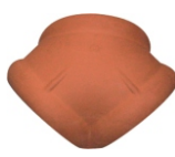
Hip cap No. 399 for roof pitches of 16° - 50° Weight: approx. 3,3 kg