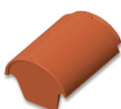
Roof ridge beginner/ender No. 3002/3003 Cover length: approx. 330/315 mm Cover width: approx. 275 mm Weight: approx. 7,7/6,5 kg