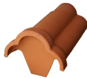
Roof ridge beginner/ender No. 1002/1003 Cover length: approx. 320/340 mm Cover width: approx. 210 mm Weight: approx. 4,0/4,9 kg