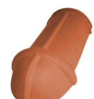
Ridge Beginner No. 301 Cover length: approx. 390 mm Cover width: approx. 200 mm Weight: approx. 4,1 kg