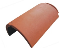
Ridge/hip tile No. 3000 Cover length: approx. 385 mm Cover width: approx. 275 mm Needed: approx. 2,7 pro m Weight: approx. 5,0 kg