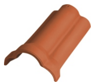
Ridge/hip tile No. 1000 Cover length: approx. 375 mm Cover width: approx. 210 mm Needed: approx. 2,7 pro m Weight: approx. 3,4 kg