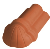
Ridge beginner No. 1001 Cover length: approx. 370 mm Cover width: approx. 210 mm Weight: approx. 3,2 kg